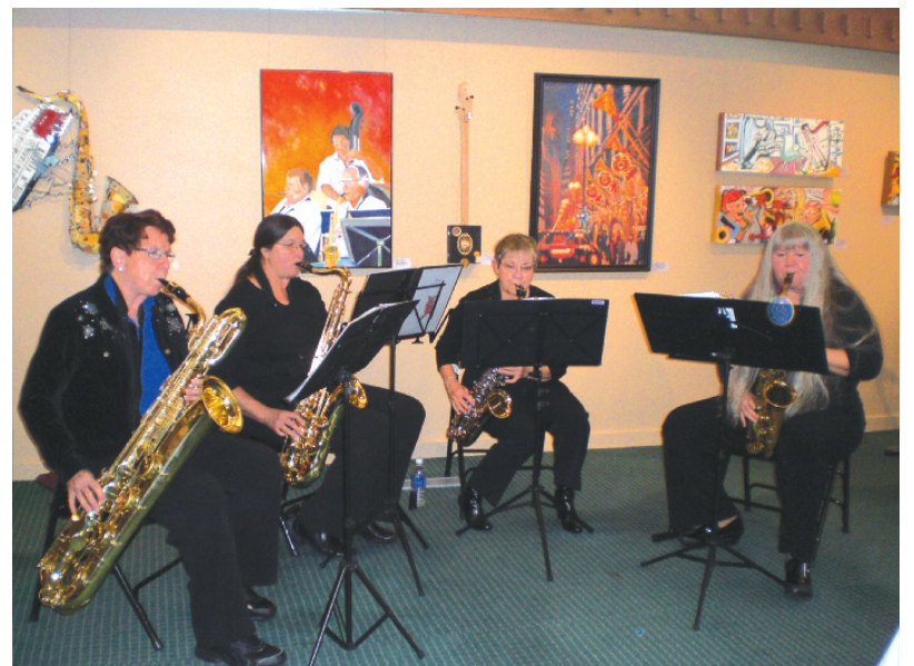
The Charlevoix Sax Quartet play at the book launch party.