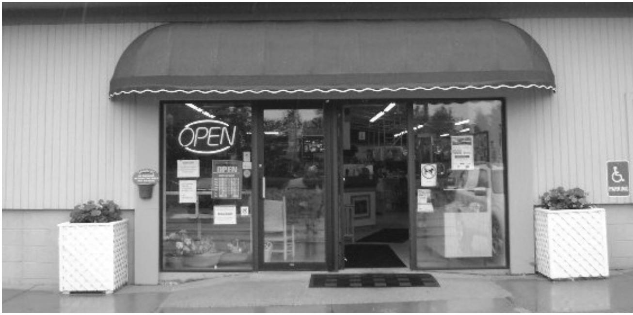
HarborHabitatRestorePhoto; Customers shopping at the Habitat for Humanity Restore facility in Harbor Springs not only enjoy huge savings in price, they are helping to build the new home dreams of the families the Habitat organization helps each year.